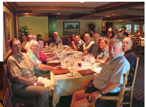
Members from Boston to San Diego get together for dinner in Park City, Utah.