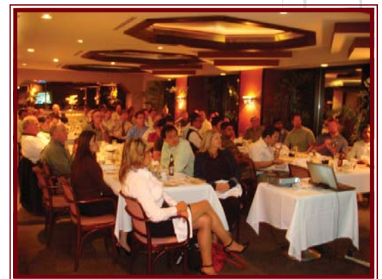
An excellent turn out!