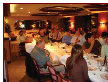
The audience gave the speaker their full attention.