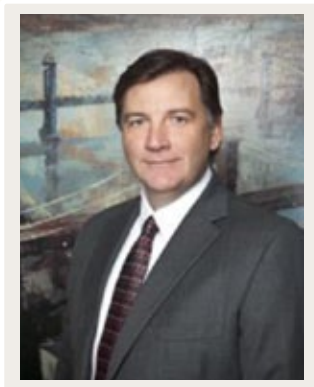
GREGORY MARTIN ATTORNEYS AT LAW GREGORY S. MARTIN & ASSOCIATES, P.A.